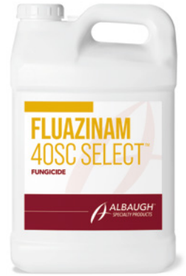
Multi-site fungicide exclusively for golf course turfgrass. Pg. 8