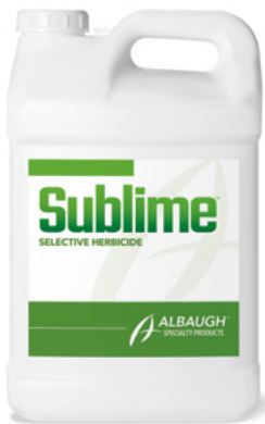
Unique 3-way herbicide like no other. Pg. 5