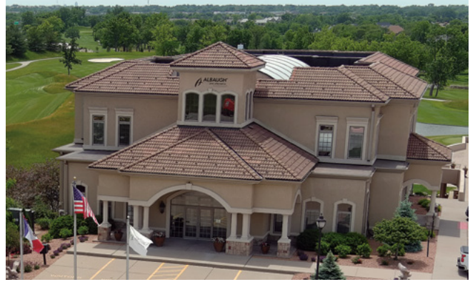
Albaugh, LLC global headquarters, located in Ankeny, Iowa.