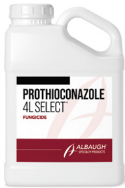
Broad-spectrum DMI fungicide for year-round control. Pg. 9