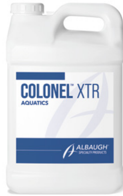
Chelated copper effective for controlling algae and submersed weeds. Pg. 7