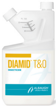
Season-long grub control with excellent application flexibility. Pg. 10