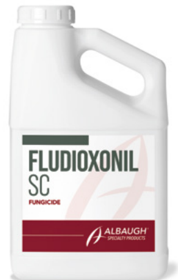
Contact fungicide for strong control of major turf diseases. Pg. 8