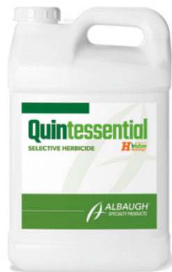
Separate yourself from ordinary quinclorac. Pg. 5