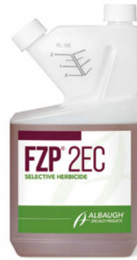
Fast, effective over-the-top solution for grassy weeds. Pg. 4