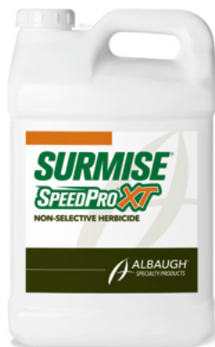
Quick, non-selective knockdown and at least 90 days residual. Pg. 7