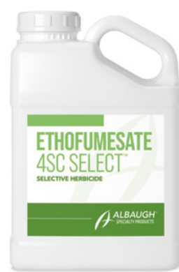
Formulated for effective control of Poa annua . Pg. 4