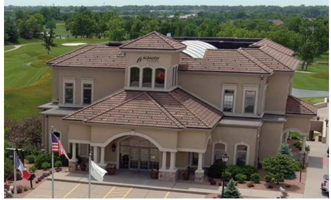
Albaugh, LLC global headquarters, located in Ankeny, Iowa.